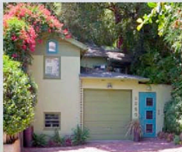
WOODSY LOCATION: The cottage is nestled amid trees, including 15 California oaks.