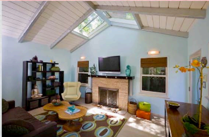
FUNKY CANYON FEEL: Skylights were added by a previous owner to lighten up this two-bedroom, two-bath Laurel Canyon cottage, once considered dark and slightly dingy.