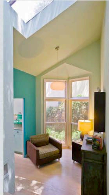
LIGHT AND AIRY: The cottage underwent a $200,000 floor-to-ceiling renovation.