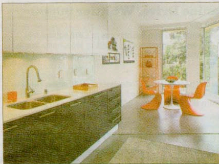
COMPACT: Kitchens have Caesarstone countertops, Bosche appliances and Italian cabinets.